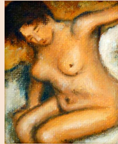
Figure 8- Oil on Canvas. 2.75 x 2.25 in