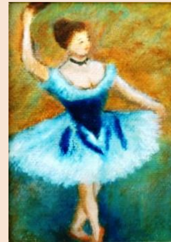
Figure 12 - Oil on Linen Canvas, 2 x 1 in

Degas completed paintings in his studio that originated as sketches of living models, strongly influencing later artists such as Picasso and Toulouse-Lautrec.