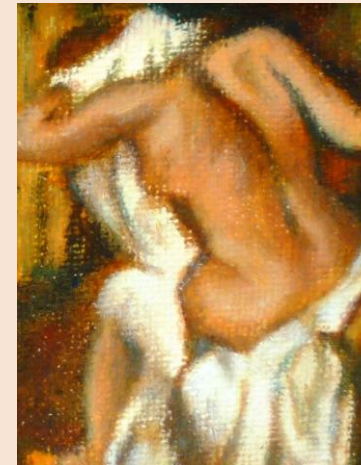
Figure 6 - Oil on Canvas, 2.75 x 2.25 in