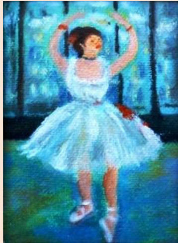
Figure 11 - Oil on Linen Canvas, 2 x 1 in