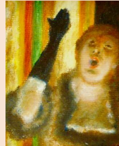
Figure 16 - Oil on Canvas, 2.75 x 2.25 in

During the late 1870s, Degas and his friend, the American artist Mary Cassatt were both working on pastels that depicted scenes from theatres in Paris. These public sites of urban leisure embodied the values France's newly established Third Republic, including the importance of secular entertainment, although French women did not get the right to vote until 1945.