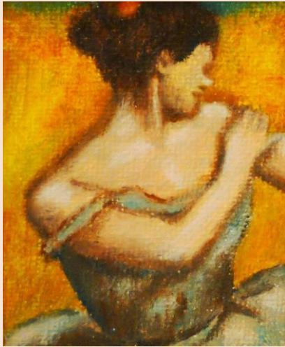
Figure 13 - Oil on Canvas, 2.75 x 2.25 in