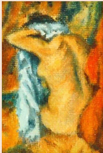
Figure 9 - Oil on Canvas, 3. x 2.5 in