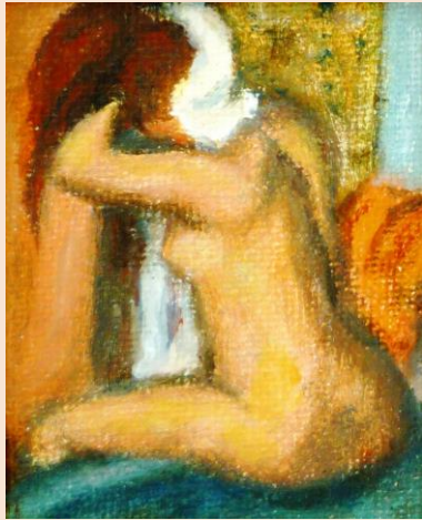
Figure 3 - Oil on Canvas, 2.75 x 2.25 in