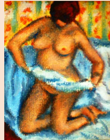
Figure 10 - Oil on Canvas, 2.75 x 2.25 in