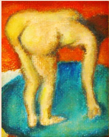
Figure 1 - Oil on Canvas, 2.75 x 2.25 in

Some fifty monotypes of brothel scenes survive. It is possible that others were destroyed by Degas heirs. They are not blatantly pornographic, nor are his observations of the women cruel or caricatural. He is amused and amusing, aware of their humanity and the inherently comic aspects.