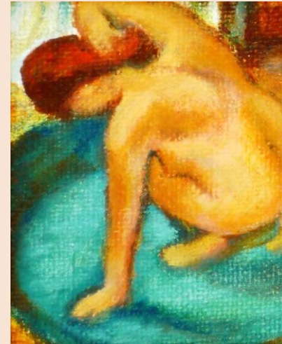
Figure 2 - Oil on Canvas. 2.75 x 2.25 in