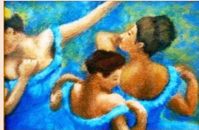
Figure 14 - Oil on Canvas, 2.5 x 3.5 in

The lowly state of the ballet enabled Degas to capture the reality, in contrast to the artifice, of a dancer's working life, above all the blood, sweat and tears that permeated the rehearsal rooms.