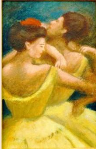
Figure 15 - Oil on Canvas, 3.5 x 2.5 in