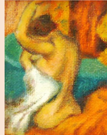
Figure 4 - Oil on Canvas, 2.75 x 2.25 in